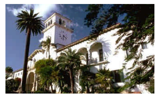
The County Courthouse is one of the architectural gems of Downtown Santa Barbara.